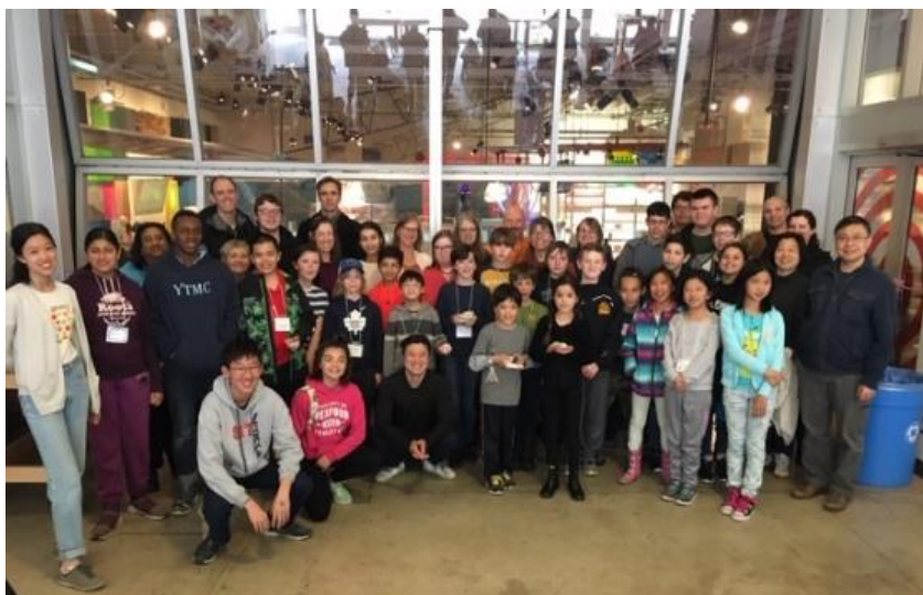
Class of 2018

The whole family is included in the single-family annual membership fee of $75. A family must include at least one adult who is related to the YTMC child participant as a parent, guardian, foster parent, or grandparent. It can include up to two adults from this list. The family may include any number of siblings and foster children. Other family structures may be considered at the discretion of the YTMC council. Parents/guardians are encouraged to remain at the meeting.